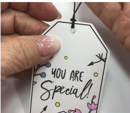
Cinch ends tight through loop - leave length of thread long until after tied around package