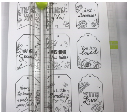
Cut apart using trimmer