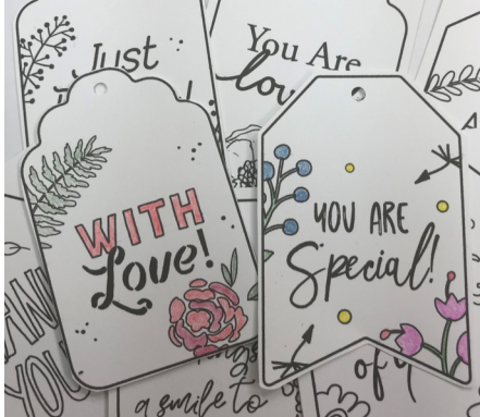
Cut and prep tags