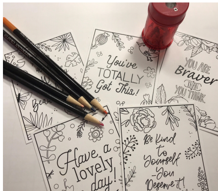
Coloring with pencils Keep pencil sharpener on hand