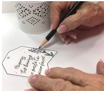
Light handed coloring Can always add more color, but difficult to take color away