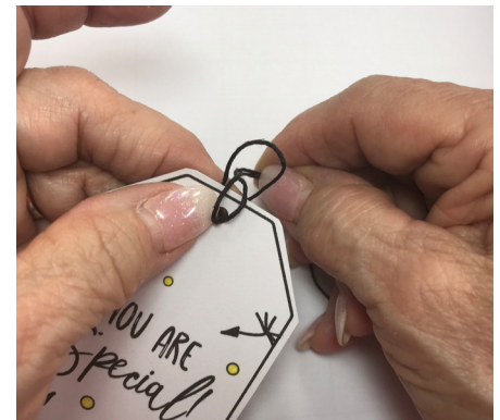
Push thread ends through the loop