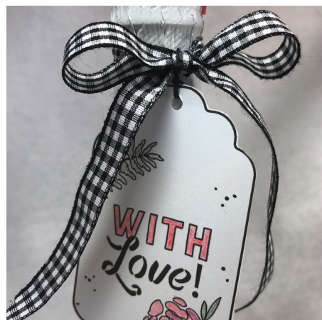
Sparkling cider and bottles of wine.