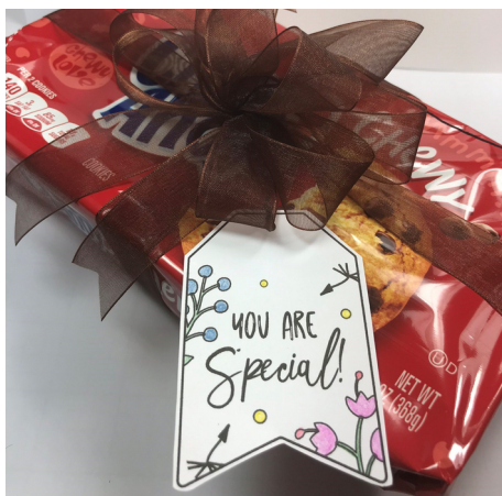
Add a tag to someone's favorite munchie.