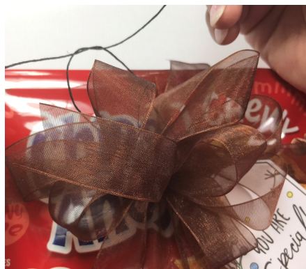
Tie ends around an added bow using loose ends - tie knot and cut ends to desired length