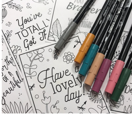
Coloring with markers