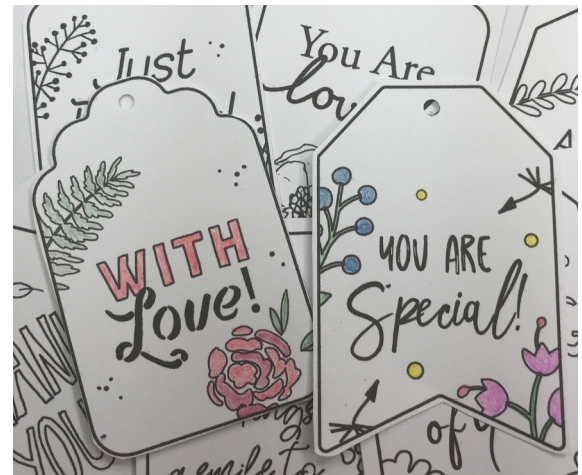
Tags are ready to attach to your gift