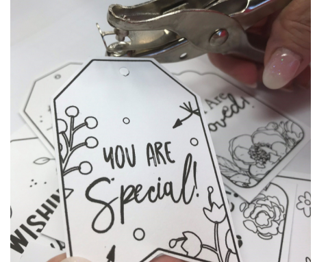
Time to get your tag ready to attach to your gift of kindness