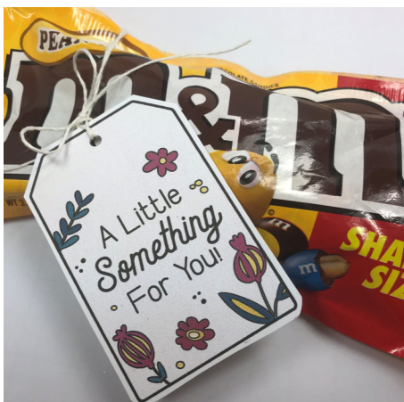
Inexpensive treats are perfect items to add to a kindness tag.