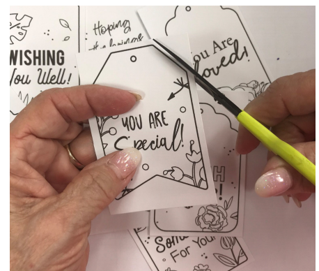
Detail cut around outside black line