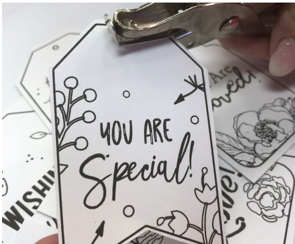
Punch tag hole - 1/8" hole punch