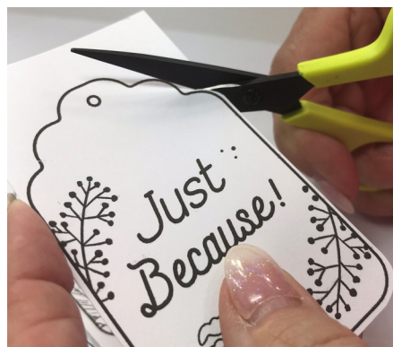
When cutting around curves, move paper allowing scissors to be guided by the movement