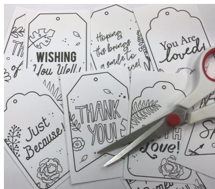
OR cut apart using scissors