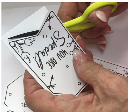
Take care cutting around inside corners