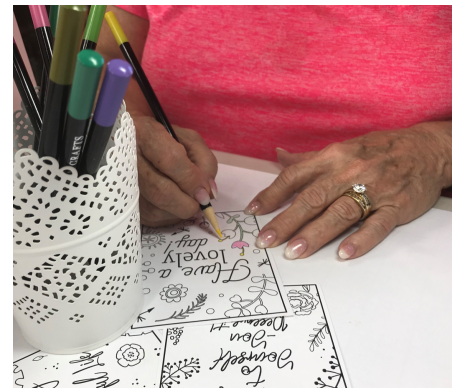
As you become more comfortable, you can blend colors together for different looks