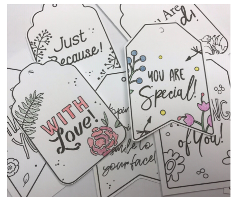
Once colored and detail cut, time to add them to your gifts of kindness