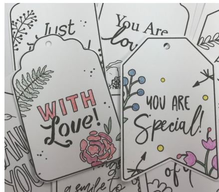
Keep your coloring supplies and printables handy so you can easily color when time permits