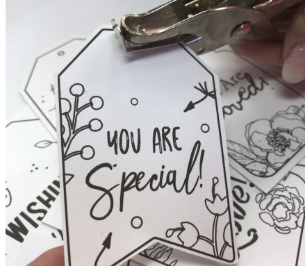
Punch hole in center of tag using 1/8" punch