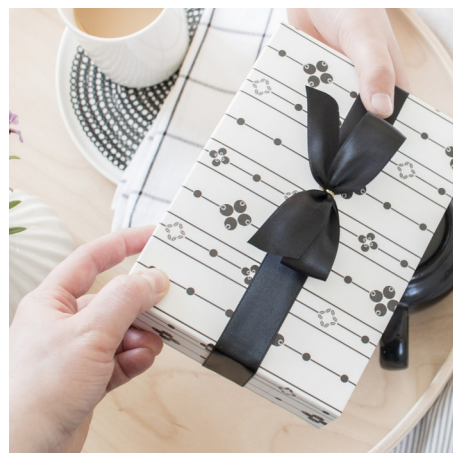
Who will receive your gift of kindness?