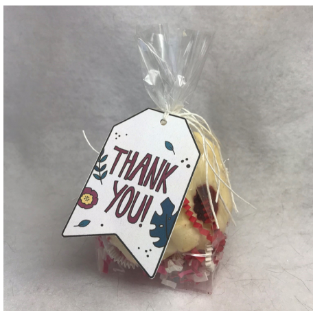
Bag up some homemade (or bought) cookies and add a tag.