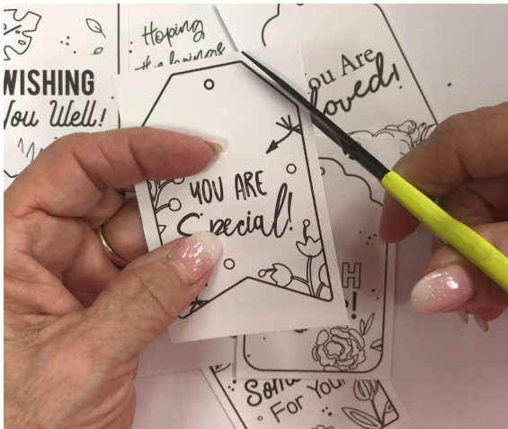
Cut tags apart

Pre-colored tags are also available to you - if you are busy and in a crunch for time, print, cut and have them available as needed.