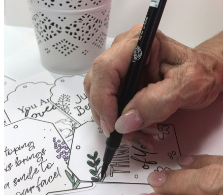
Take care not to push too hard on marker nib (brush)