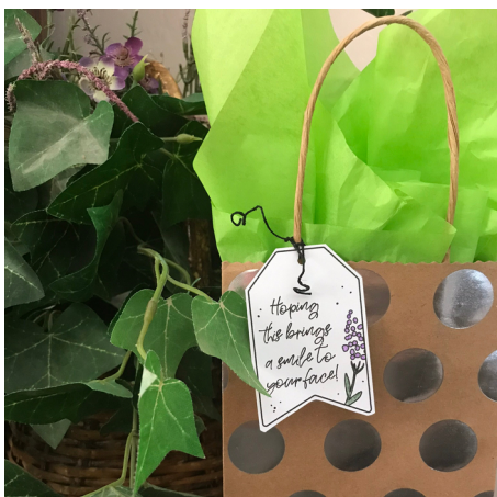
Perfect on a gift bag.