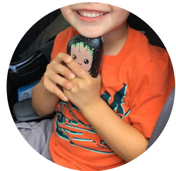
Find and Repeat