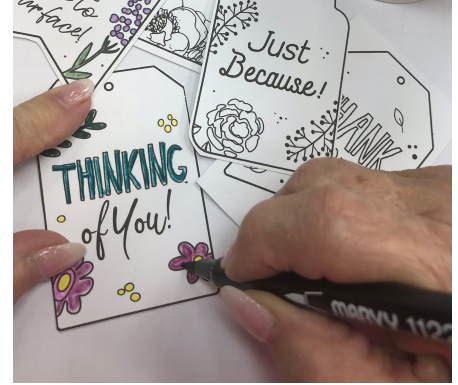
Color all open areas