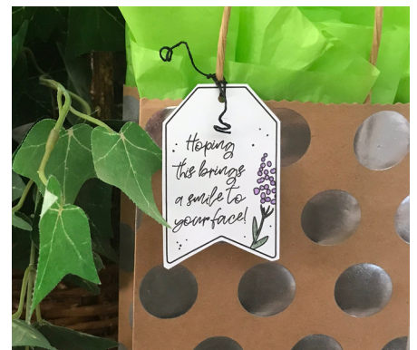
Tie tag ends around handle of a gift bag - It's easy to attach a tag when you have something on which to attach it.