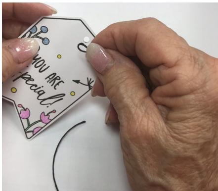
Cut twine (ribbon) approx 18" in length