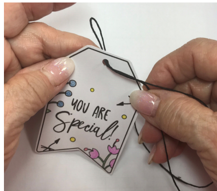
Fold twine in half - thread loop portion through hole