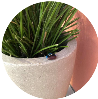
Hide and Repeat